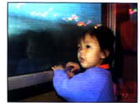
You too will believe . . .

Nov. 24, 25, 30, Dec. 1, 2, 5, 6, 7, 8, 9, 12, 13, 14, 15 & 16 Cost: $22.00 Adult, $20.00 Senior, $17.00 Youth (2-12)